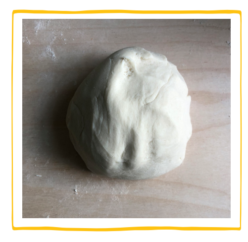
2. Slowing add 1/2 cup of water and kneed into a smooth dough. Add more flour if it feels too sticky or a little water if it's too dry.

1. Start by mixing 1 cup of flour with half a cup of table salt. You can use any cup or mug to measure, just make sure you keep using the same one.