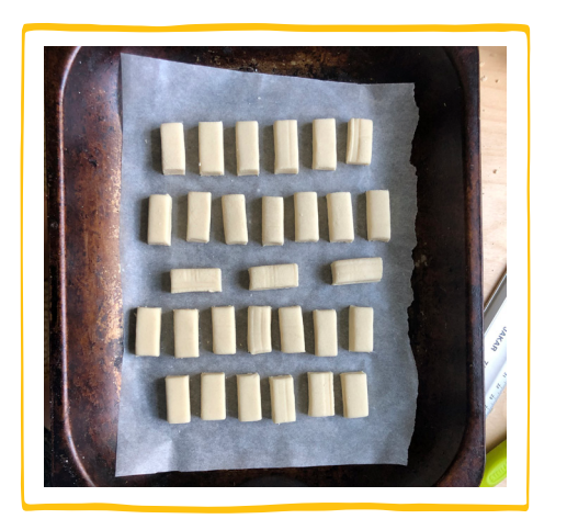
7. Gently place your dough bricks onto a baking tray on top of greeseproof paper and heat in the oven for 2.5-3 hours at a low temperature (around 130 c).