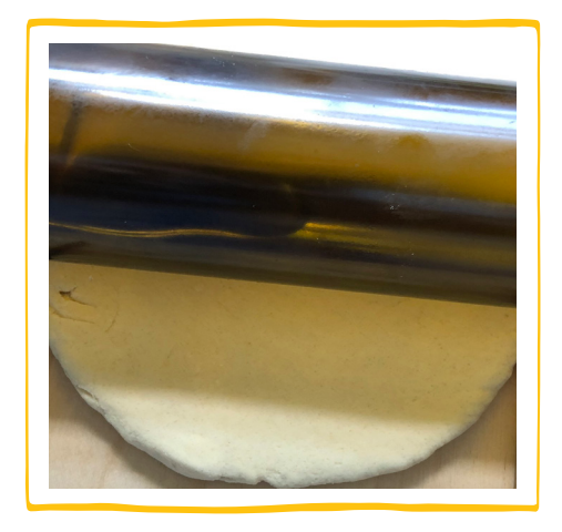
3. Roll your dough to the thickness you want your bricks to be. For my bricks I have made them 1.5cm thick. Then cut away the edges to make a rectangle.