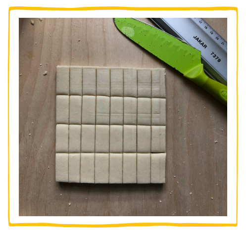
5. Get an adult to help you cut your dough.