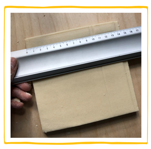
4. Using a ruler and a pencil lightly mark out the width and length of your bricks. Try not to press down with the ruler.