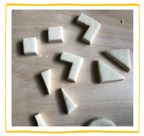
6. You can make any shape or size you like, get creative!