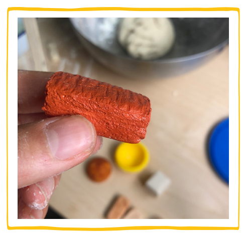
8. Leave to cool fully. Your bricks should now be hard and ready to paint and build!